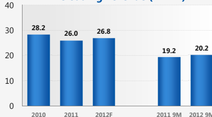
Reloading Revenue (LVL M)